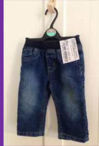
Ensure each item is clean and ironed and on a hanger