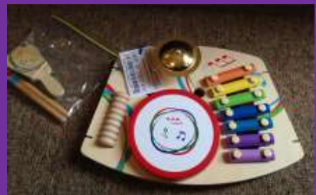
Put smaller items and instruction booklets in plastic bags and ensure the label description mentions what is included