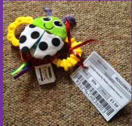
Use string or ribbon to attach your Label