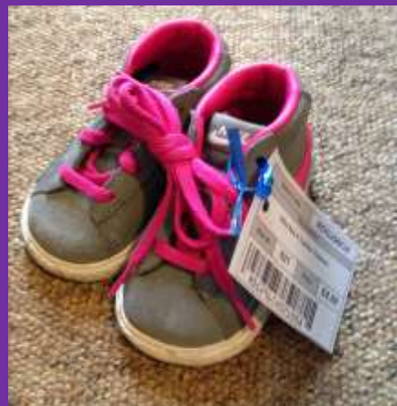
Items with multiple parts must be securely attached together