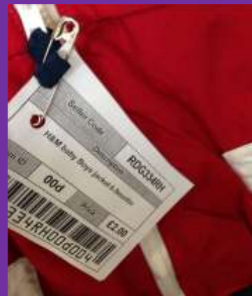
Use a hole punch and safety pin the label to the item, making sure the barcode and information can still be read